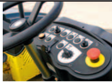
All controls are centralized for ease of operation.