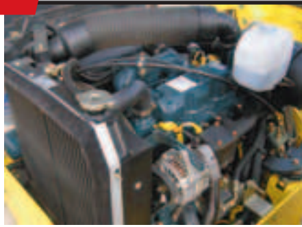
Easy access to Kubota diesel engine and drive components.