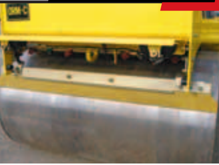
Pressurized water system with wind protected quick-disconnect spray nozzles.