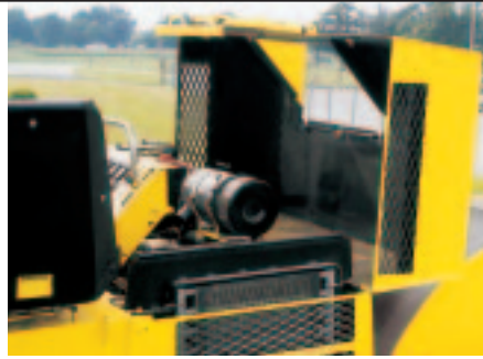
All daily maintenance checkpoints and filters are easily reached