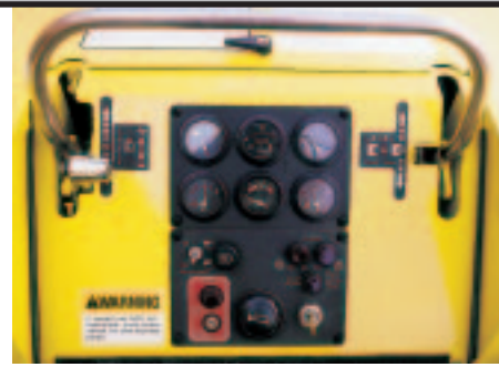
Simplified operation through convenient location of controls