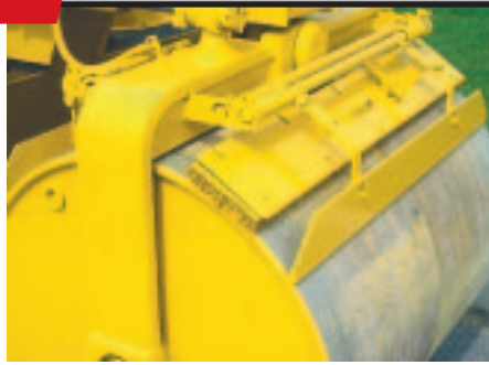
Each drum is standard equipped with a full width cocoa mat and two scraper bars for cleaning in both directions of travel