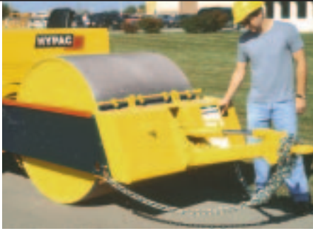
The C330B 4-6 ton design with tow package allows for easy transportation of the compactor