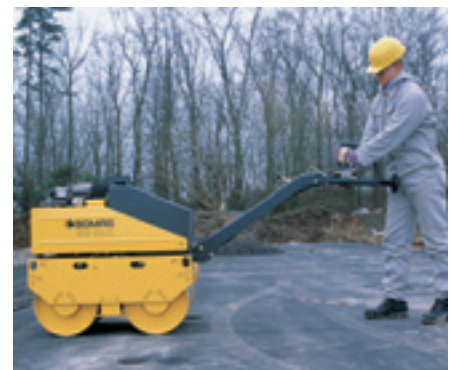
The BW65H provides better compaction results