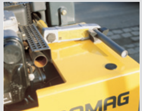
The safety starting handle is easily accessible

With these features and many more, it's easy to see why this model maintains a high residual value while delivering lower lifetime operating costs.