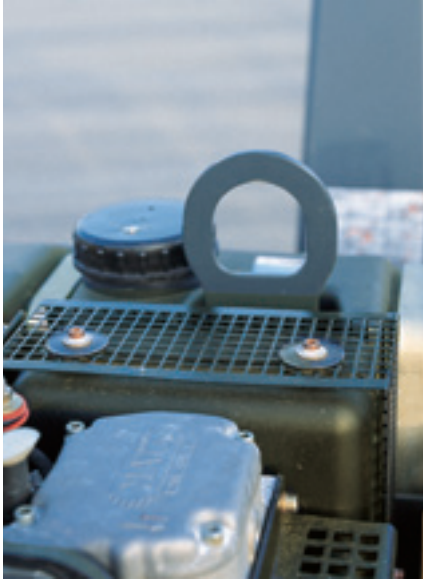
Balanced central lifting eye ensures safe and easy transporting