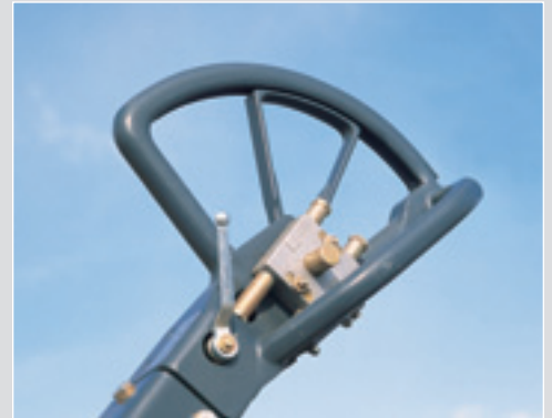
Operator-friendly arrangement of controls