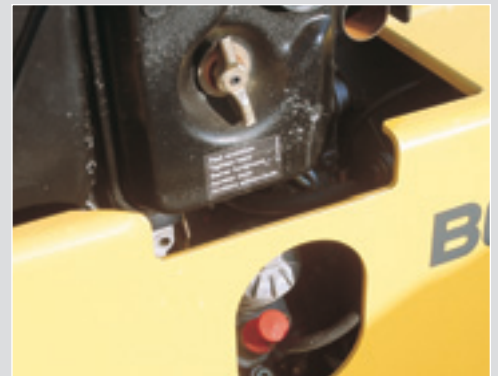
The oil level gauge and air filter are easily accessible for maintenance