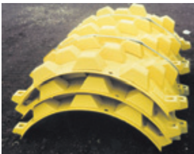
Padfoot Shell Kit for smooth drum equipped rollers.