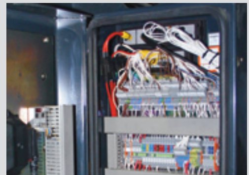
Centralized electrical panel allows systematic and efficient trouble shooting.