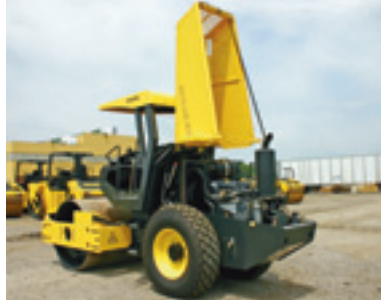
Easy access due to the vertical opening hood makes daily checks simple and efficient.