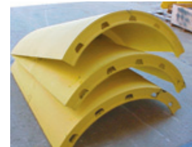
Smooth Shell Kit for padfoot drum equipped rollers.