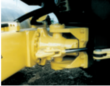
Maintenance-free, rugged, oscillating-articulation joint bolted on the outside of the front and rear frames.