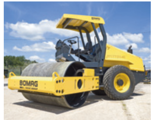
The BW177DH-40 provides excellent gradeability and traction for demanding applications.