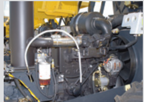
Tier III Cummins diesel engine - economical and easy to maintain.