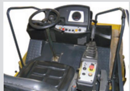
Ergonomic layout of operators platform and controls.