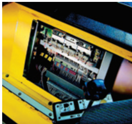
Centralized electronics with Modular Circuit Technology