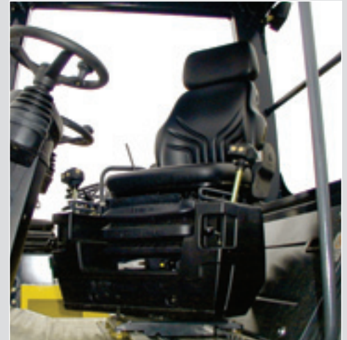
Seat can be moved laterally from side to side or swiveled through 180°

Revised operator's station provides unobstructed view of the drum surface(s), drum edges and surrounding worksite area