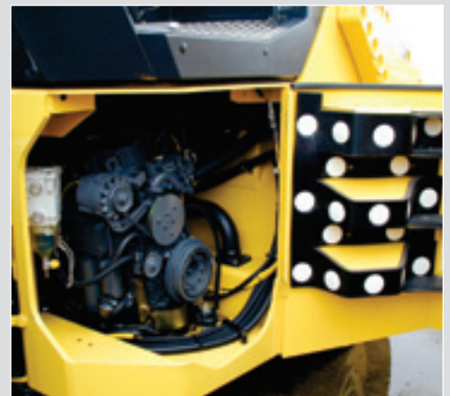
Easy access to engine and hydraulic components from either side