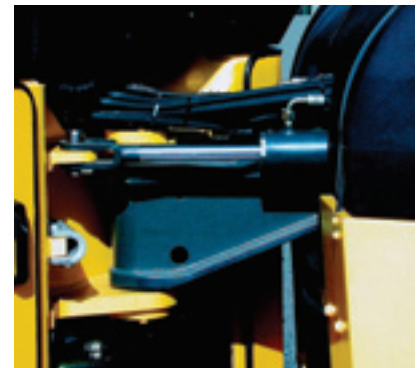
Centerpoint articulated steering with standard crab steer off-set provision.