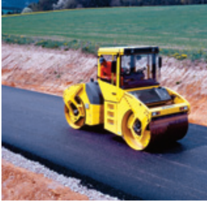
With higher frequencies and centrifugal forces providing higher productivity and profitability. (Unit shown with optional Rops/Cabin)