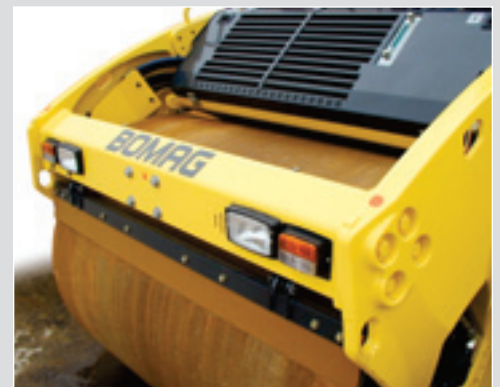
Hinged drum scrapers allow easy cleaning and replacement

With these features and many more, it's easy to see why these models maintain a high residual value while delivering lower lifetime operating costs.