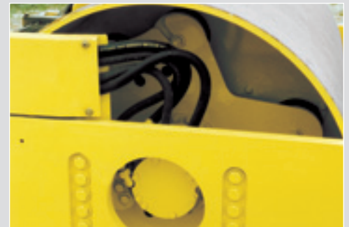
Efficient direct drum drive