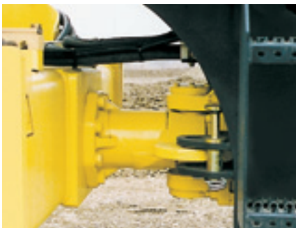
Bolt-on oscillating, articulation joint for long life and servicing ease

High compaction performance means greater productivity and better profits