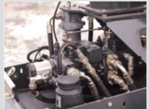
Dual travel pump design of the DH / PDH-3 models further enhances tractive effort and gradeability.

With these features and many more, it's easy to see why this model maintains a high residual value while delivering lower lifetime operating costs.