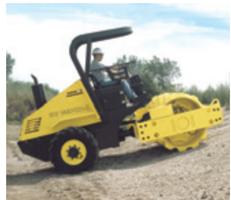
BW145PDH-3 Padfoot model for cohesive material. Also available with optional leveling blade.