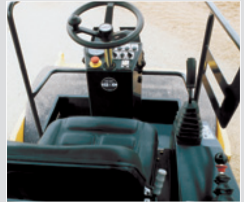
Excellent all-round visibility and ergonomic control layout

High compaction performance means greater productivity and better profits