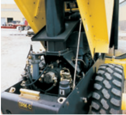
Wide opening hood provides easy access to all components