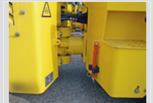
Bolt-on center-joint, with standard crab steer off-set, provides long life and ease of repair.