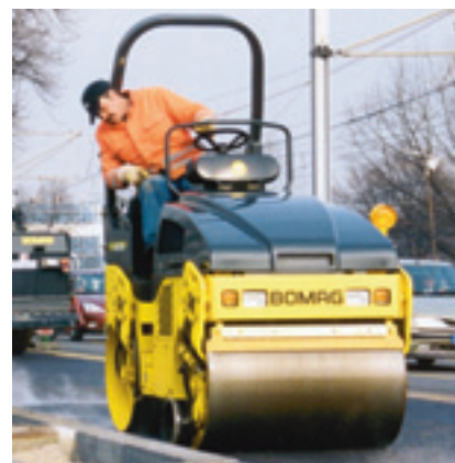
BW100AD-4 rolling a curbline.