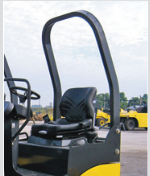
Vibration isolated operators platform minimizes operator fatigue. Standard ROPS with safety seat belts.