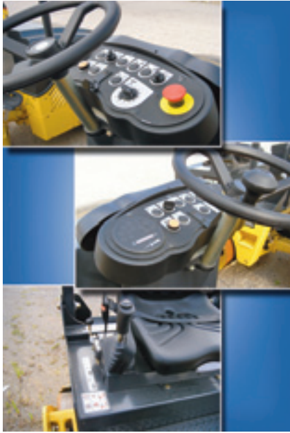
Ergonomically engineered operator's platform providing optimum comfort and maximum productivity.