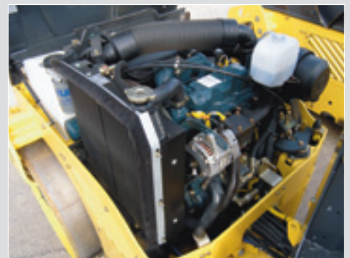
Easy access engine and drive components for simplified servicing

With these features and many more, it's easy to see why this model maintains a high residual value while delivering lower lifetime operating costs.