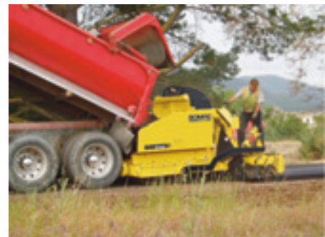
BF815 paving a secondary road.