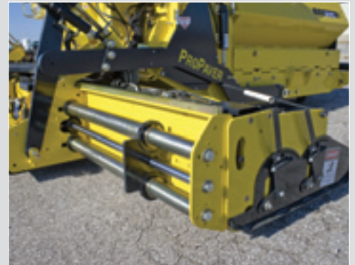
The screed extensions of the BF814 / BF815 have been designed to give the operator exceptional control of the material, as well as a uniform, fully screeded mat.