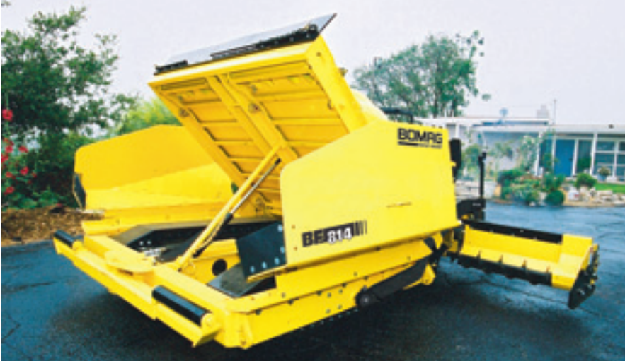
The hopper of the BOMAG BF814 / BF815 can be raised over 6' high, allowing for easy maintenance access to the undercarriage.