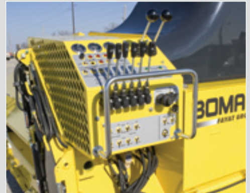
Ergonomically improved operator's control panels.

With these features and many more, it's easy to see why this model maintains a high residual value while delivering lower lifetime operating costs.