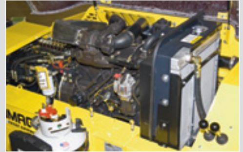
The BOMAG BF814 / BF815 water cooled, 85 Hp diesel engine supplies the power to the hydrostatic drive and pumps.