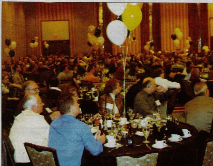
More than 300 employees and guests attended West Side Tractor Sales' 50th Golden Anniversary celebration Jan. 28, 2012, at the Blue Chip Resort and Casino in Michigan City, Ind.

For more information, visit www.westsidettractorsales.com .